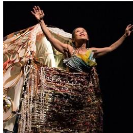
tiger princess dance project In Search of the Holy Chop Suey Ontario