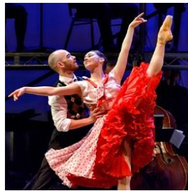
Ballet Kelowna Ballet Kelowna's Canadiana Suite British-Columbia